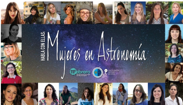
Fig. 1. Poster of the “Habla con Ellas: Mujeres en Astronomía” 2021 edition, with photos of the collaborating speakers.